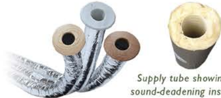
Supply tube showing its sound-deadening insulation

The Unico System Supply Outlets provide quiet delivery of high velocity air to the conditioned space. Unico outlets come in 2" round and 1 1/2" x 8" slotted and are available in a variety of colors and materials.