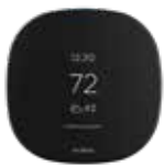
ecobee THERMOSTAT Powered by Bryant

Achieve greater efficiency and whole-home comfort with this Wi-Fi® smart thermostat.