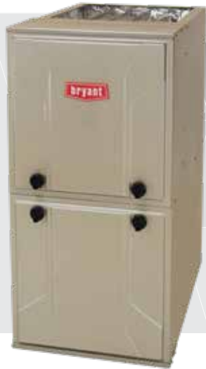
Model 915S and 912S