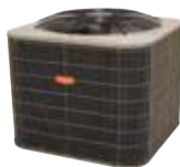
LEGACY AIR CONDITIONER

High-efficiency cooling power delivering whole-home comfort and energy savings.