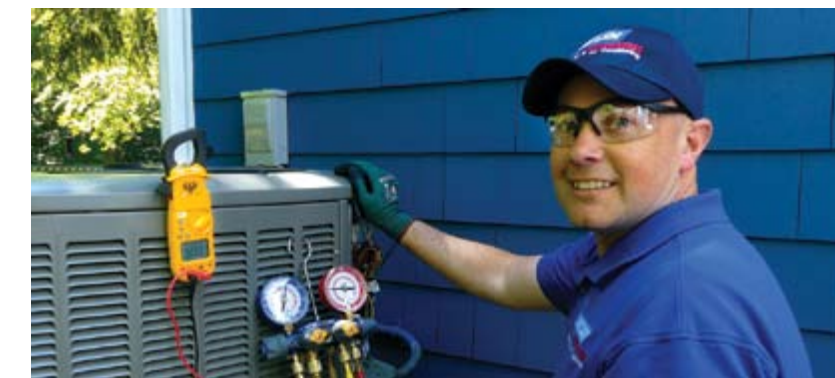
Betlem's Technicians Are NATE Trained

Today, our Residential Division has over 30 people dedicated to keeping your family safe and comfortable. These highly talented and trained individuals have dedicated most of their working lives to this industry, and they are Betlem's greatest strength.